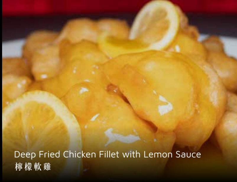
Deep Fried Chicken Fillet with Lemon Sauce 檸檬軟雞