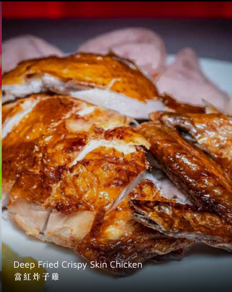
Deep Fried Crispy Skin Chicken 當紅炸子雞