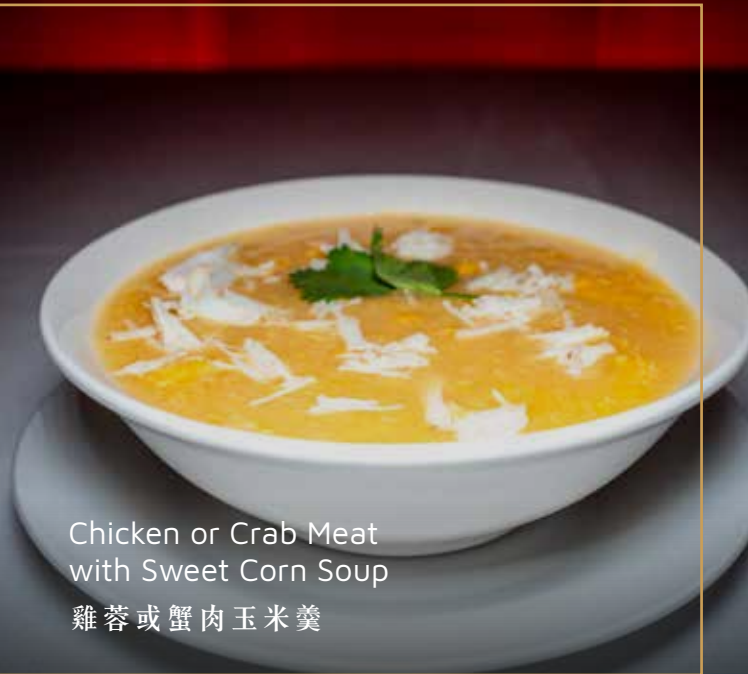
Chicken or Crab Meat with Sweet Corn Soup 雞蓉或蟹肉玉米羹