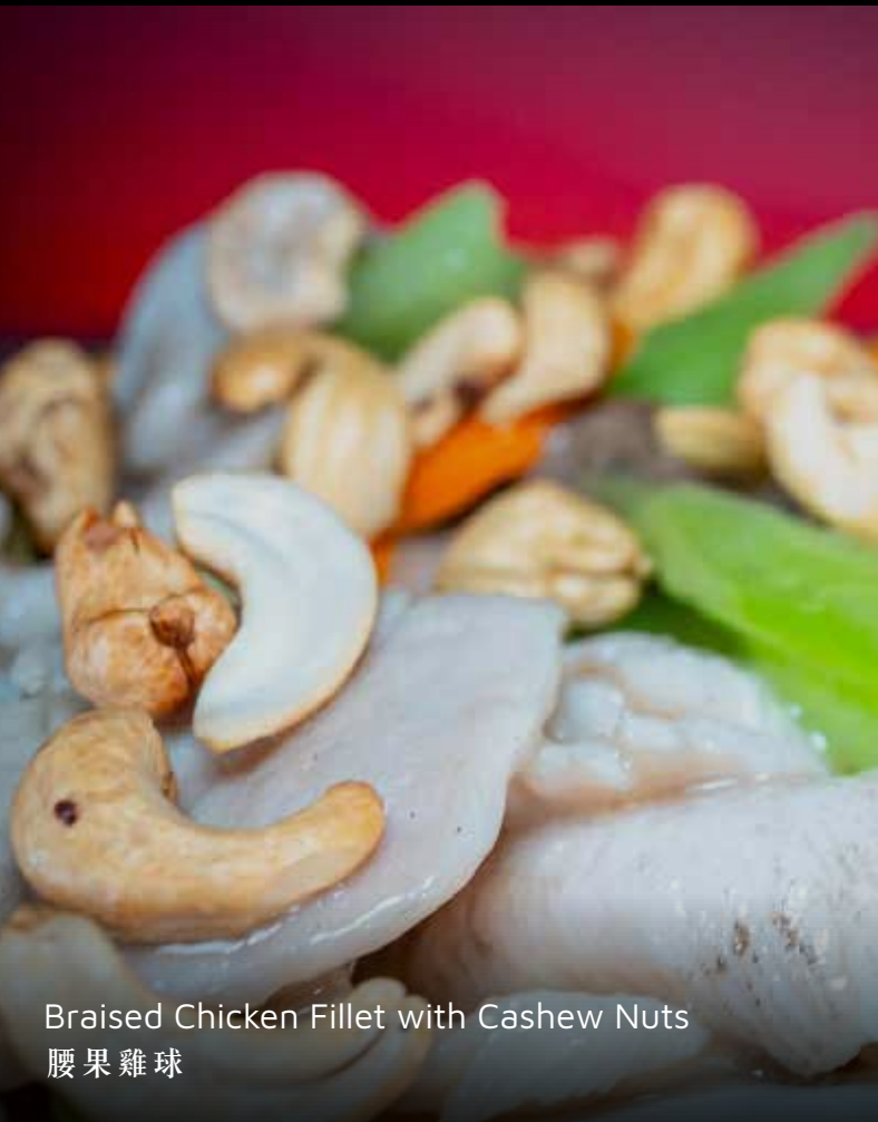
Braised Chicken Fillet with Cashew Nuts 腰果雞球