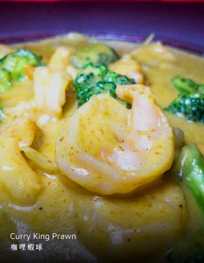
Curry King Prawn 咖哩蝦球