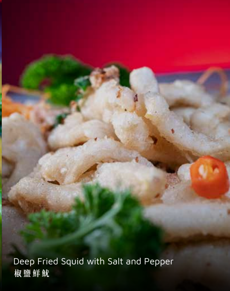
Deep Fried Squid with Salt and Pepper 椒鹽鮮魷