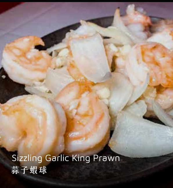
Sizzling Garlic King Prawn 蒜子蝦球