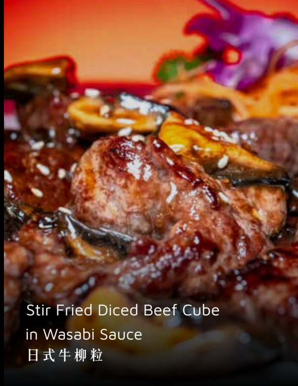
Stir Fried Diced Beef Cube in Wasabi Sauce 日式牛柳粒