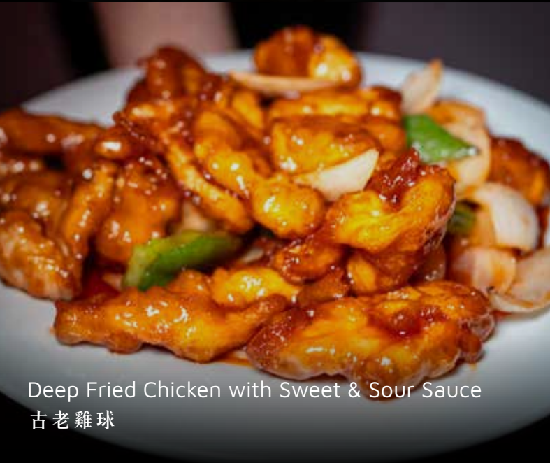
Deep Fried Chicken with Sweet & Sour Sauce 古老雞球