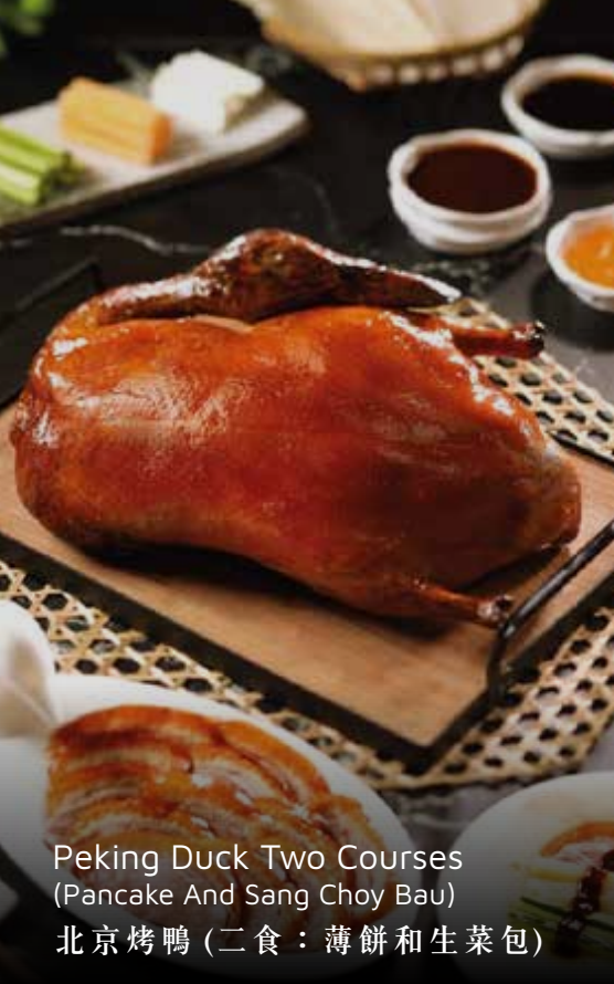
Peking Duck Two Courses (Pancake And Sang Choy Bau) 北京烤鴨 (二食：薄餅和生菜包)