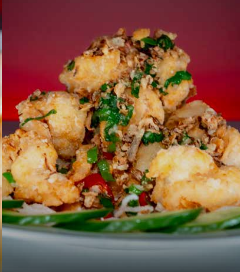
Deep Fried King Prawn with Salt and Pepper 椒鹽蝦球