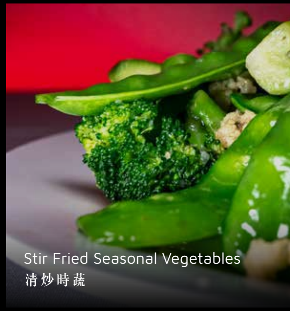
Stir Fried Seasonal Vegetables 清炒時蔬