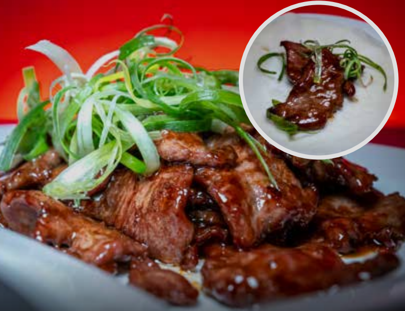
Mongolian Lamb Pancakes (6pcs) 蒙古羊肉薄餅 (6片)