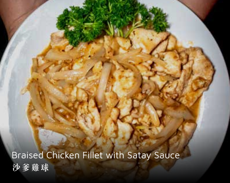
Braised Chicken Fillet with Satay Sauce 沙爹雞球