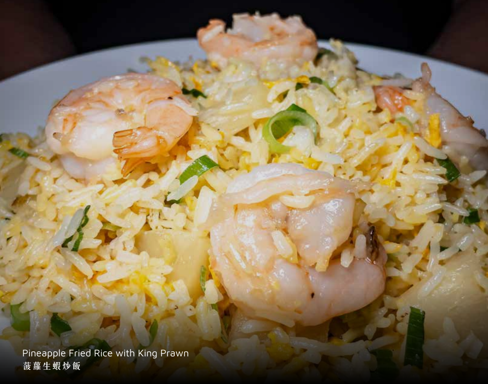
Pineapple Fried Rice with King Prawn 菠蘿生蝦炒飯