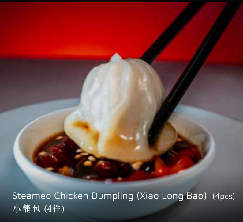
Steamed Chicken Dumpling (Xiao Long Bao) (4pcs) 小籠包 (4件)