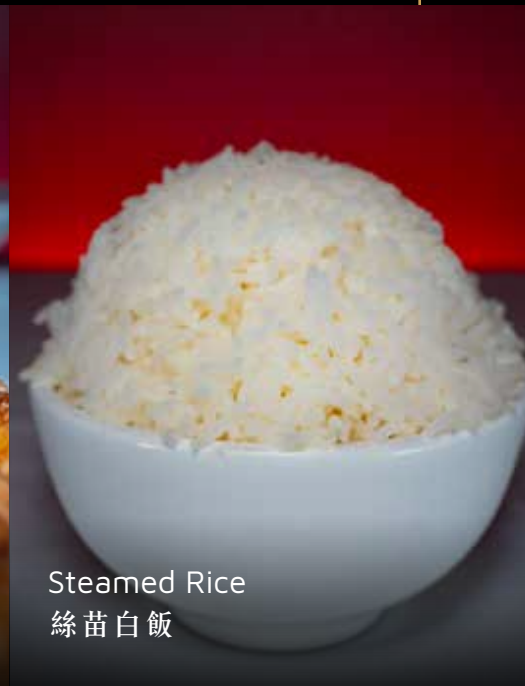
Steamed Rice 絲苗白飯