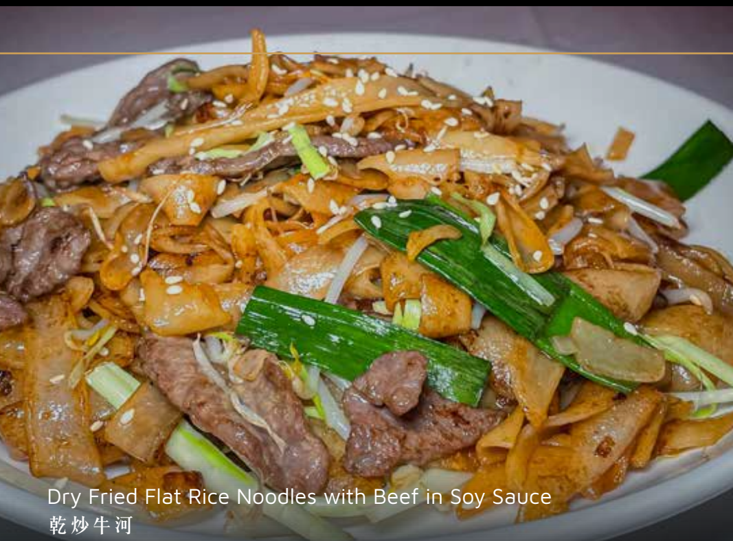
Dry Fried Flat Rice Noodles with Beef in Soy Sauce 乾炒牛河