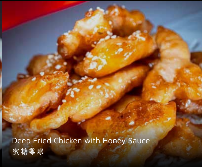
Deep Fried Chicken with Honey Sauce 蜜糖雞球