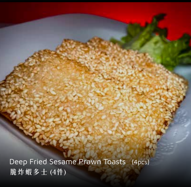
Deep Fried Sesame Prawn Toasts (4pcs) 脆炸蝦多士 (4件)