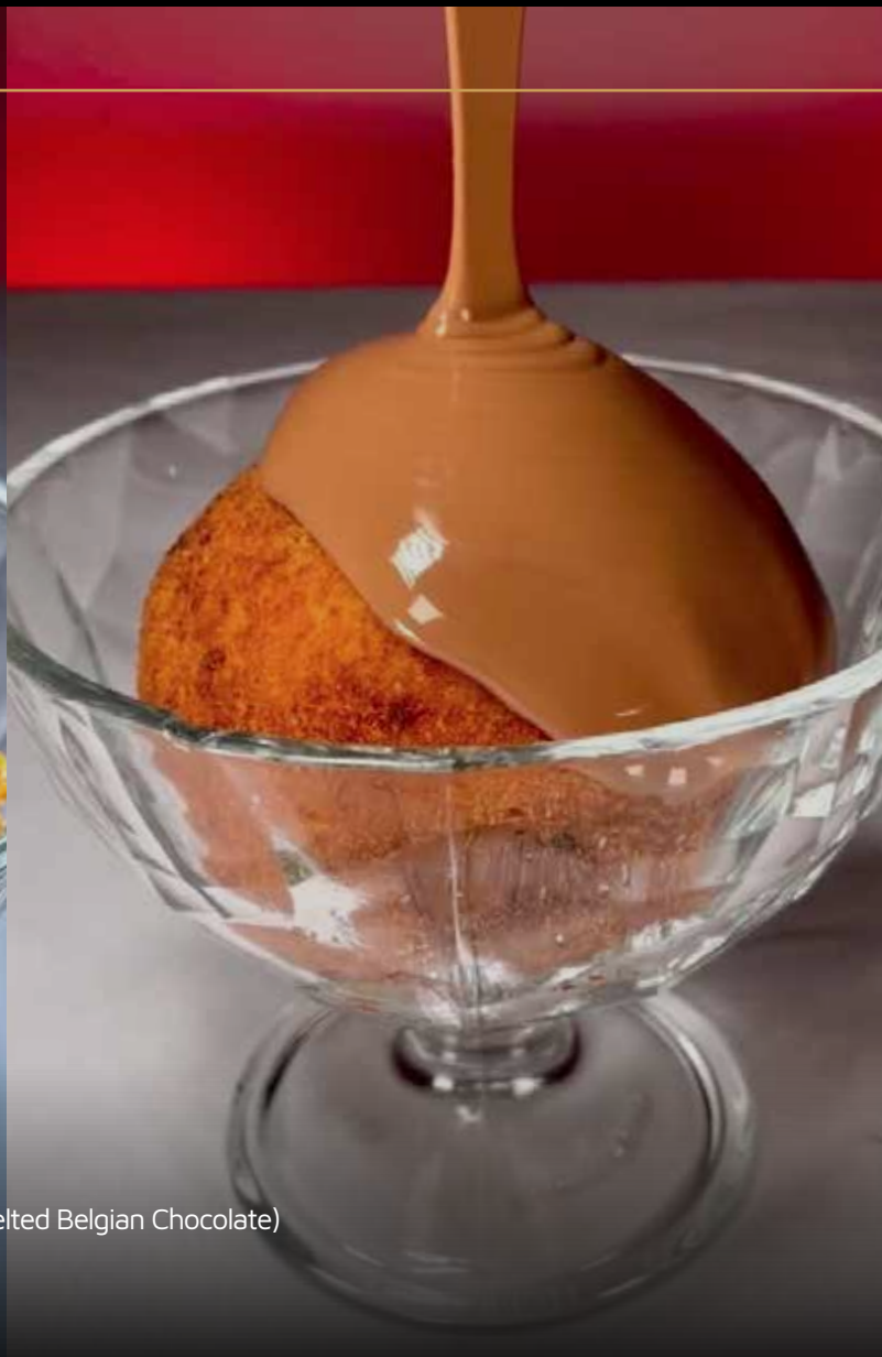
Deep Fried Ice Cream (Salted Caramel and Biscoff or Melted Belgian Chocolate) 炸雪糕 (鹹焦糖餅乾或比利時巧克力)