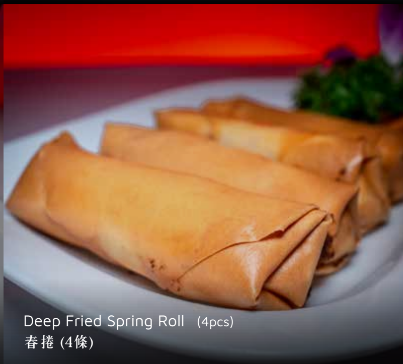
Deep Fried Spring Roll (4pcs) 春捲 (4條)