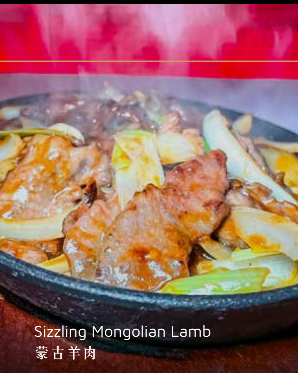
Sizzling Mongolian Lamb 蒙古羊肉