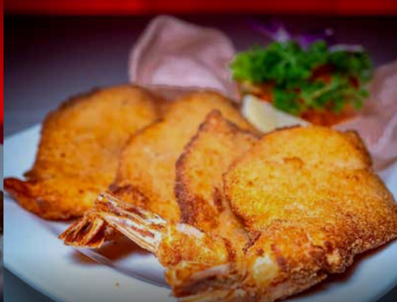
Deep Fried King Prawn Cutlets (4pcs) 鳳尾吉列蝦 (4件)