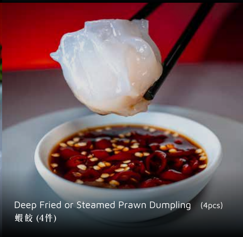
Deep Fried or Steamed Prawn Dumpling (4pcs) 蝦餃 (4件)