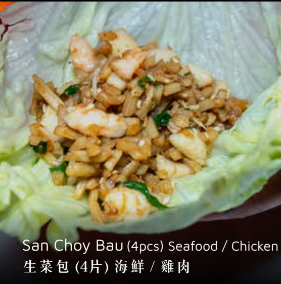
San Choy Bau (4pcs) Seafood / Chicken 生菜包 (4片) 海鮮 / 雞肉