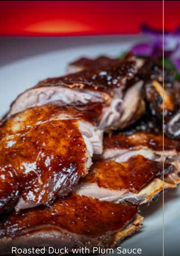
Roasted Duck with Plum Sauce 梅醬燒鴨