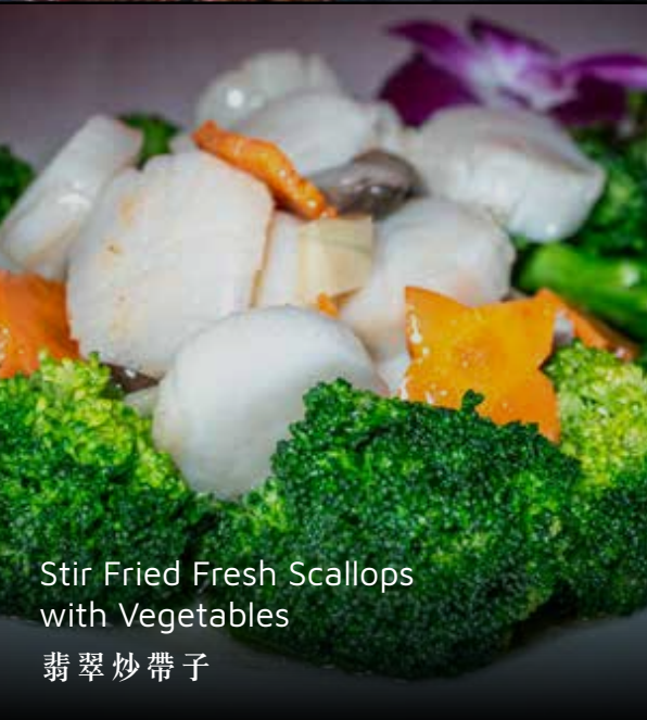
Stir Fried Fresh Scallops with Vegetables 翡翠炒帶子