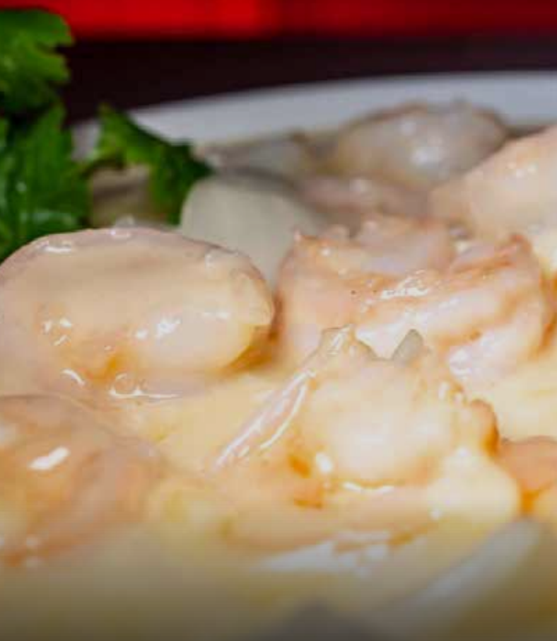
Garlic Butter King Prawn 蒜子牛油蝦球