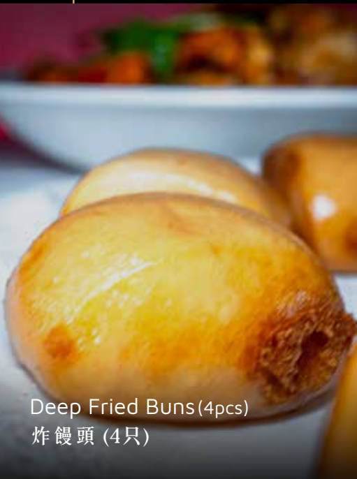
Deep Fried Buns (4pcs) 炸饅頭 (4只)